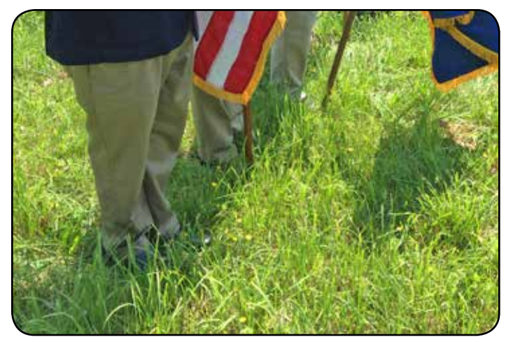
Brothers stand ankle deep in uncut grass on Memorial Day 2018.

With more and more budget problems faced by cemeteries all over the country we need to get more involved. Before major Camp events, like Memorial Day, we need to check the sites we are going to decorate. Making sure in advance they are cut, trimmed and neat.