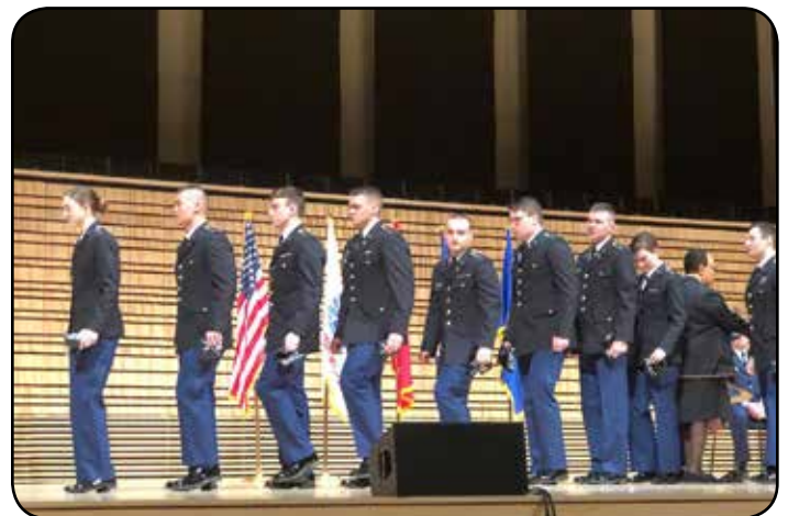
Army ROTC cadets move forward to receive their awards.