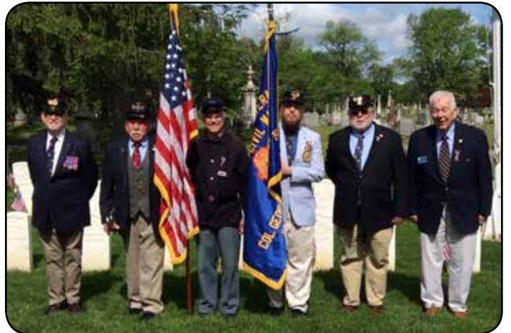
Camp Brothers stand, with their colors, before the GAR plot in Albany Rural Cemetery May 30 th .