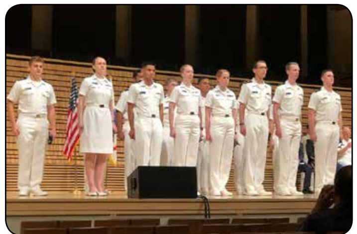
Naval ROTC members stand at attention at RPI ceremony.

Camp Brothers were on-hand at RPI to present Sons of Union Veterans of the Civil War medals to cadets at this year's ceremony. It is important for us to recognize the achievements of this younger generation.