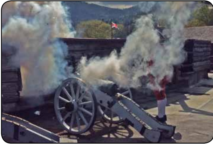
Just before the Friday night campfire the Brothers received a tour of Fort William Henry including a cannon firing demonstration.