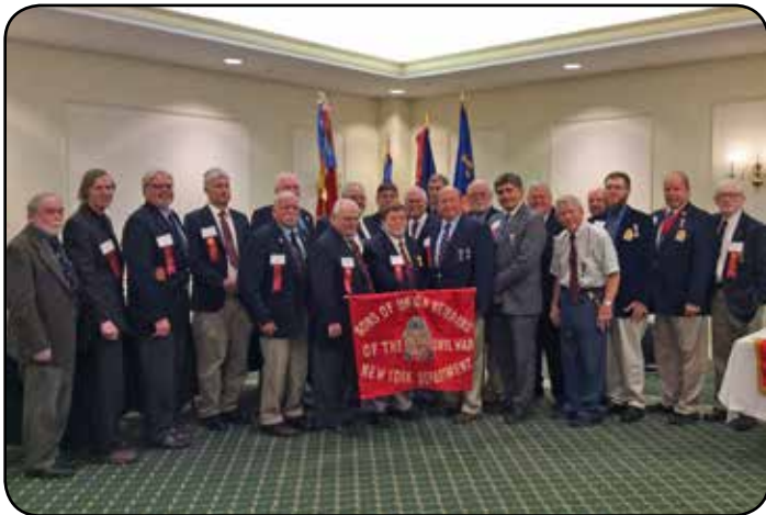
Attending members of the Department of New York take a break for a photograph with SUVCW Commander-in-Chief Shaw at the end of the business day.