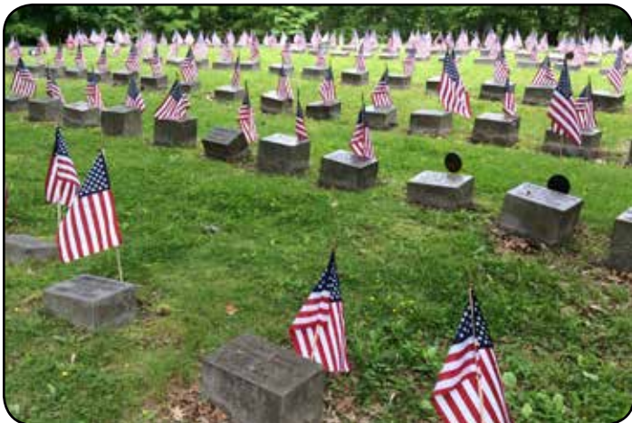
Flags fly over the brave at Oakwood Cemetery on May 30, 2019.