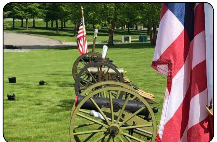
Cannons at the ready on May 25 th at the Gerald Solomon National Cemetery.