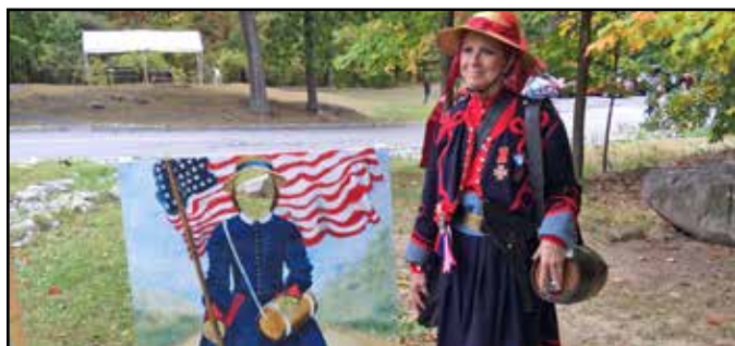
A vivandiere reenactor with the Willard Camp's vivandiere cutout.