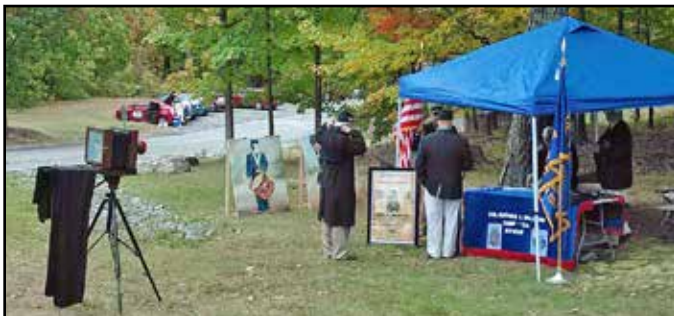
Tintype photographer prepares to document Willard Camp's display at Grant Cottage.