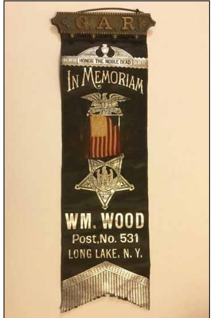
A beautiful GAR badge from the William M. Wood Post 531, Long Lake, NY.