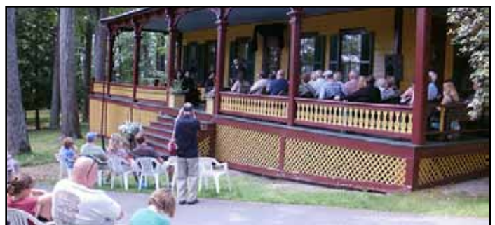
Grant's son speaks emotionally about his father to event visitors from the porch where the General died on July 23, 1885.