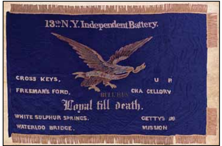
The flag of the 13th N.Y. Independent Battery which is included in the exhibit and from which the tour take's its name.

Between now and May of 2014 there will be a special 1863: Loyal till Death: A Civil War Tour at the New York State Capitol every Thursday from 5:30 to 6:30 p.m. The tour will begin at the State Street Lobby of the Capitol and will explore the importance and symbolism of regimental flags on display there. The flags are from the New York State Battle Flag Collection, administered by the New York State Military Museum in Saratoga Springs New York. After years of being poorly stored each flag was conserved by the NYS Office of Parks, Recreation and Historic Preservation in partnership with the Military Museum. If you are interested, register for a tour on-line at www.ogs.ny.gov or call 518-473-7582.