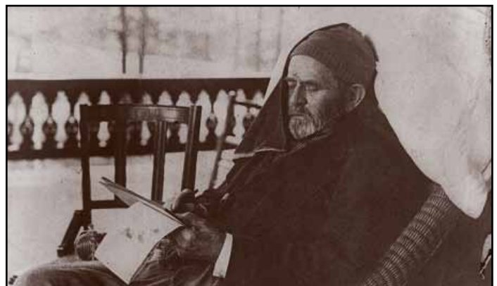
Less than a month before his death General Grant sits on the porch of his cottage at Mt. McGregor finishing the second volume of "Personal Memoirs of U.S. Grant."