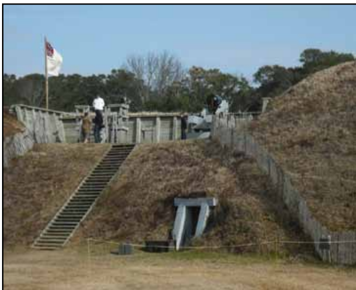
One of the large Confederate batteries protecting Wilmington, NC at Fort Fisher.