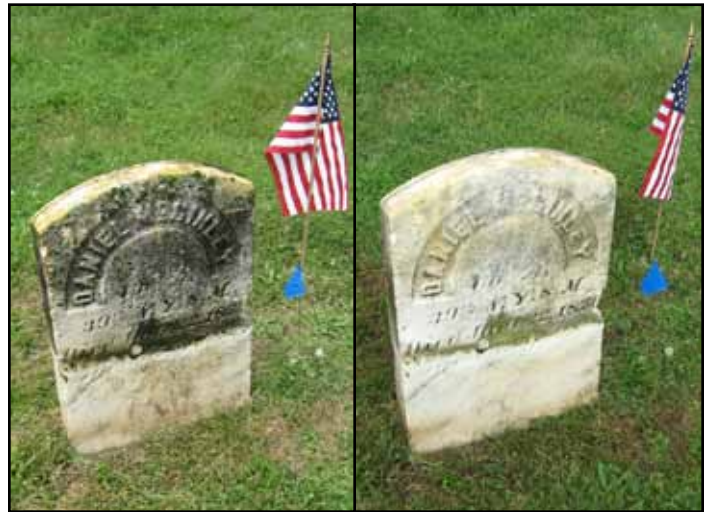
A before and after photograph of a Civil War veteran's stone cleaned by the Camp members at St. Agnes Cemetery on May 28th. Over 50 stones were cleaned in this manner during the day's activities. See Spring 2012's Guidon (page 4) for details of the process used.