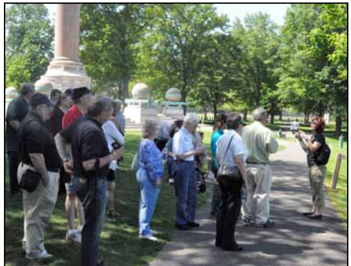
Part of the Encampment was a tour of West Point on Sunday morning. Many of the Brothers took advantage of the tour including members of G.L. Willard Camp 154.