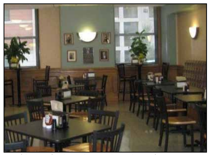
View of the GAR Cafe, otherwise known as The Courthouse Cafe.

The GAR Cafe, otherwise known as The Courthouse Cafe is now open for business. It is located in the Albany County Courthouse's G.A.R. Room at 16 Eagle Street, Albany, NY. If you are downtown and have some time stop in. The Brothers of the Col. Willard Camp would like to wish them well.