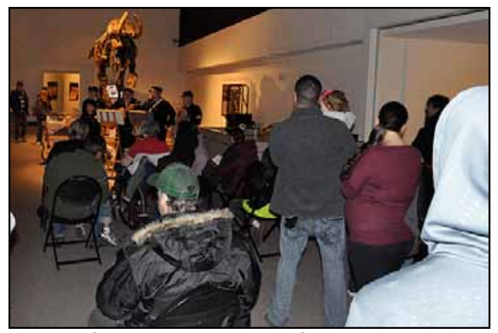
Large group of museum visitors enjoy the music of the "Iron Jacks" under the watchful eyes of the State's mastodon on November 24, 2012.

On November 24, 2012 the Iron Jacks who are a sing group that is part of the U.S. Naval Landing Party performed at the N Y State Museum in Albany to the delight of the museum visitors. Almost all of the Jacks are also members of the Col. George L. Willard Camp SUVCW. The group also displayed a large number of Civil War related artifacts.