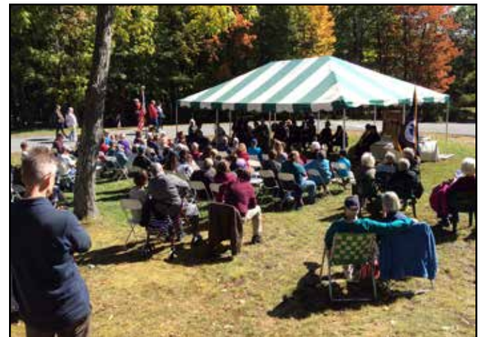
An estimated 500 people attended the Grant Cottage encampment event. The photograph shows one of two "press conferences" held by Grant's generals at the event.