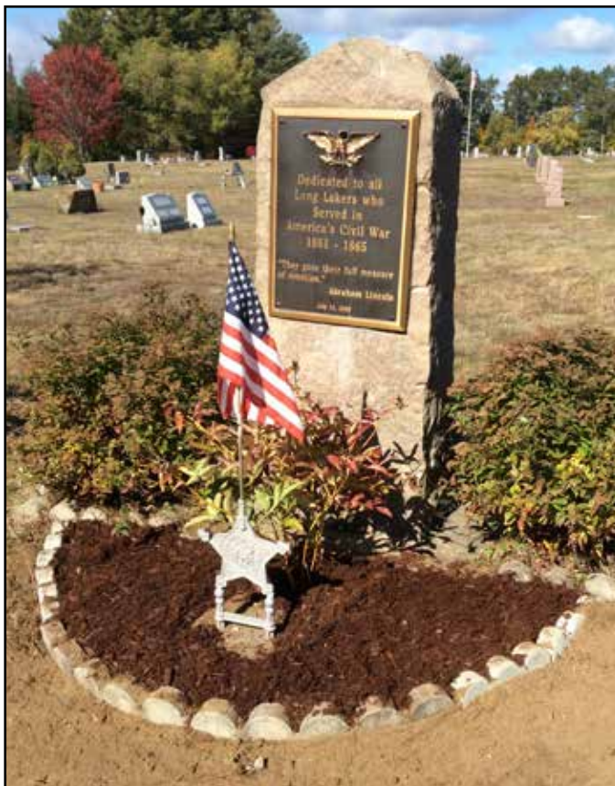
The new reproduction GAR marker in place at Civil War monument in Long Lake. Landscaping was also improved.