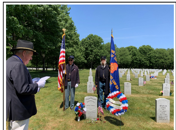
Graveside ceremony for the Civil War Unknown.

The location of the bench is within the line-of-sight to the grave of the Civil War Unknown whose remains were recovered from the Antietam battlefield.