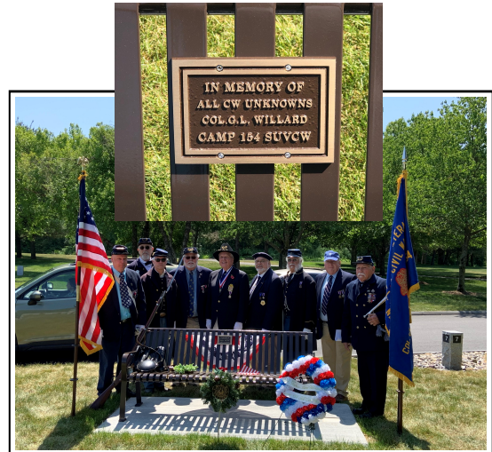
Camp members at the bench dedication. Inset shows the plaque on the bench.

Willard Camp dedicated a bench to the Unknown Civil War Dead at the Gerald Solomon National Cemetery (GSNC) on May 30, 2023.