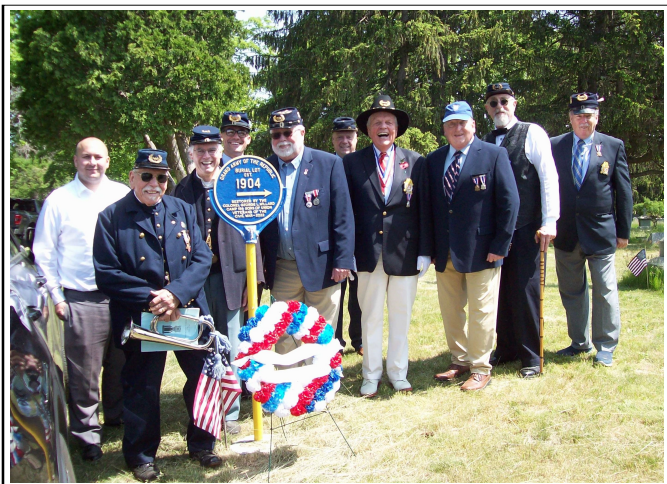
Camp members at the GAR plot in Albany Rural Cemetery for Memorial Day Weekend exercises (5/27/23).