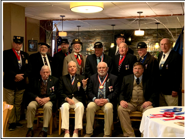
A group photograph of the Brothers present at the luncheon.