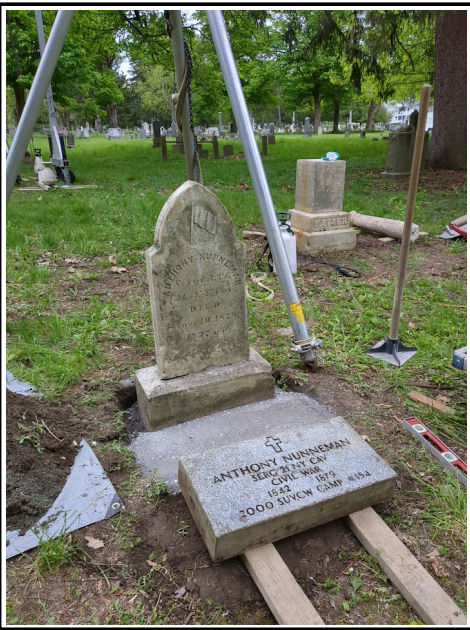
Conservation of the gravestones of Anthony Nunneman, 21st NY Cavalry. The original stone was re-set and the modern stone was re-leveled. Both were cleaned.