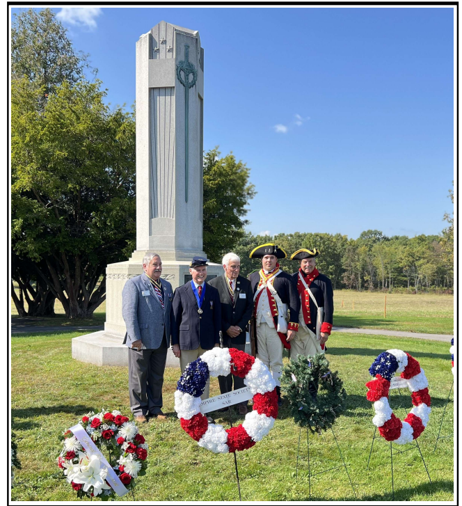
Pictured are members of SUVCW from across the state of New York who were present for the wreath laying.