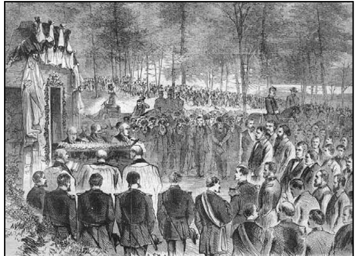
The casket of Major General George Thomas is carried into a vault at Oakwood Cemetery in Troy, NY on April 8, 1870.

An interesting illustration has come to light. While conducting research it was discovered that Harper's Weekly ran a full front page story on the funeral of General Thomas in its April 23, 1870 issue. The article included this woodcut of this scene at tOakwood Cemetery. According to Harper's , President Grant, General Sherman, General Hooker, and many other distinguished men were present to honor his memory. The story states that his remains were placed in the Kellogg vault. There is a vault nearby his grave but it does not look like the one in the illustration depicted in Harper's Weekly . More research is needed to identify the correct vault. There was also a very interesting article on the funeral in the New York Times of April 9, 1870. If you would like to view these articles you may go to the following web sites: