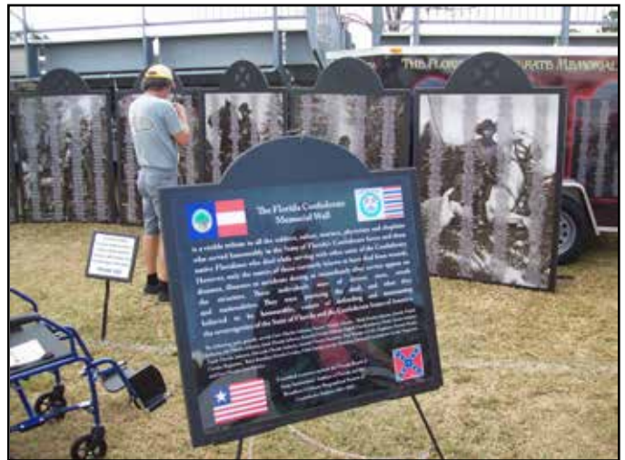
Confederate Wall of Honor of those who died of illnesses, wounds, diseases or accidents during or shortly after the war.