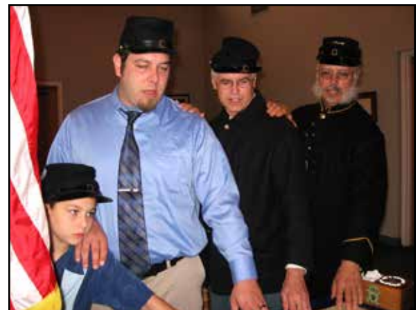
A son, a father and two brothers become Willard camp members.