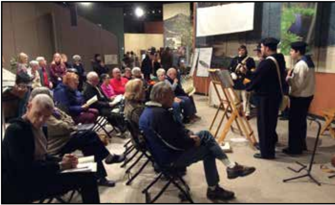
The Iron Jacks, part of the US Naval Landing Party, entertain museum visitors with Civil War period music and songs.