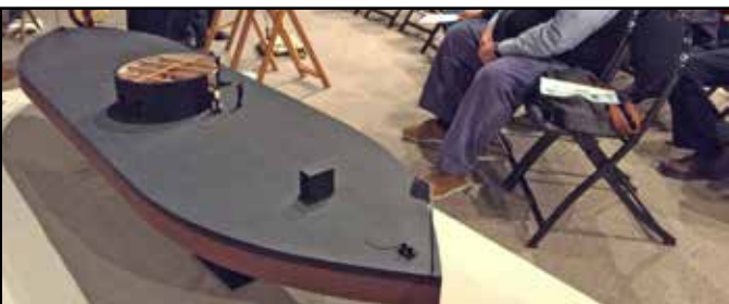
Brother Keough's 54 mm scale model of the USS Monitor