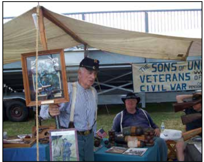
Local Brothers working their display during the two day event.