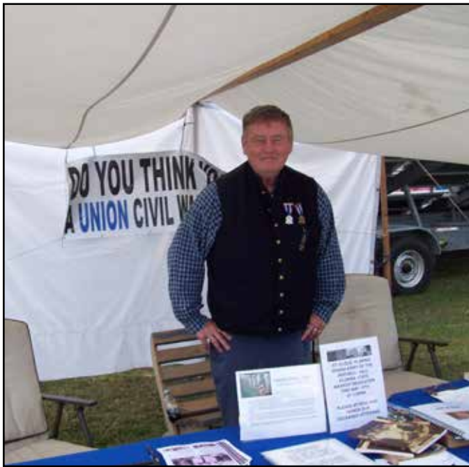
Local Sons of Union Veterans of the Civil War Camp Commander at the Narcoosse Mill event.