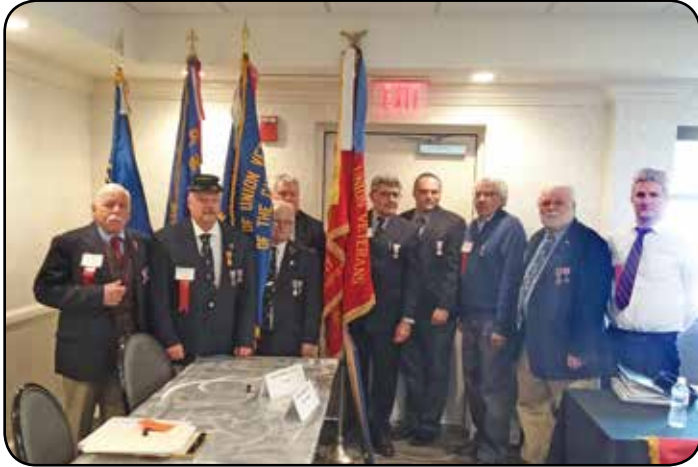
New Department of New York officers.

The Department of New York, Sons of Union Veterans of the Civil War, held its 135 th Encampment in Rochester, NY from April 20 th to the 22 nd . It followed the traditional format with the Campfire program held on Friday night, the business meeting on Saturday and the memorial service on Sunday morning.