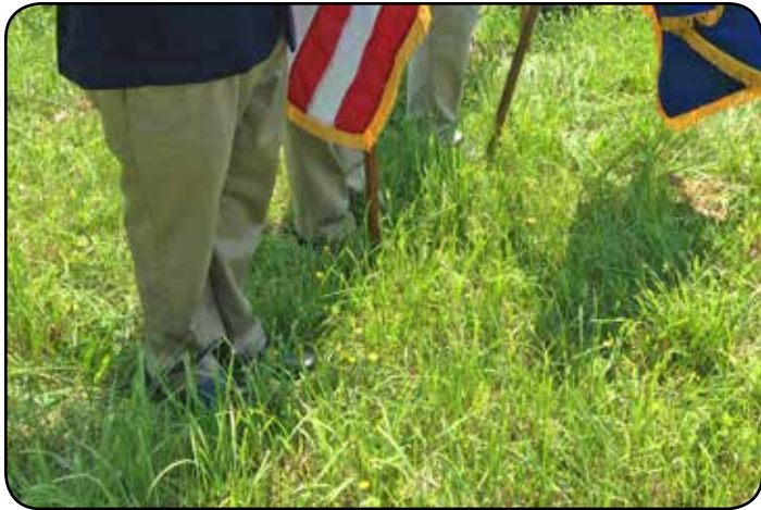
Brothers stand ankle deep in uncut grass on Memorial Day 2018.

With more and more budget problems faced by cemeteries all over the country we need to get more involved. Before major Camp events, like Memorial Day, we need to check the sites we are going to decorate. Making sure in advance they are cut, trimmed and neat.