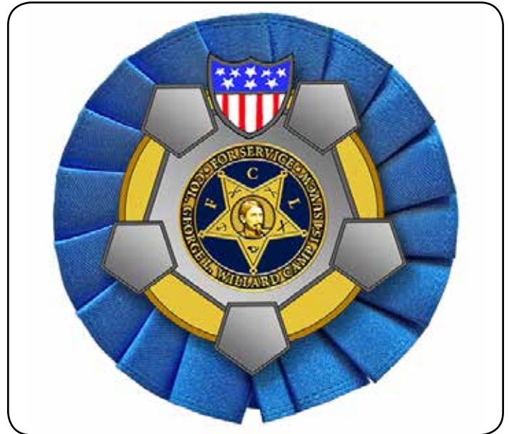
Illustration showing the badge of the highest level in the Legion of Merit.