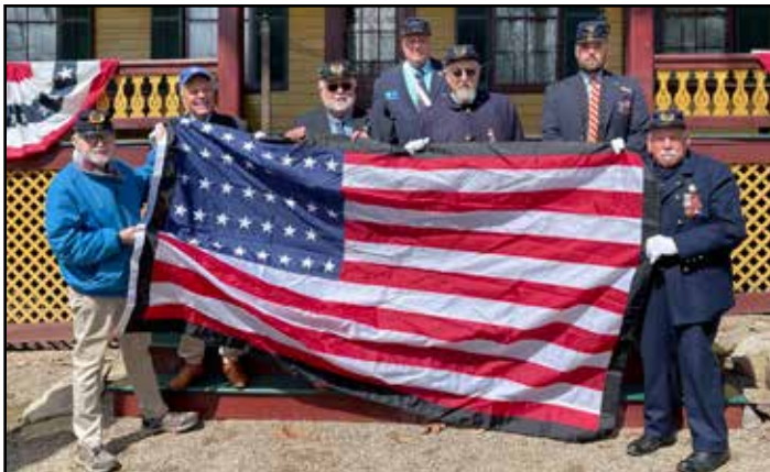
Camp Brothers holding the new 48 star American flag with 2" black border.

The Brothers of the Col. George L. Willard Camp 154 then conducted a flag ceremony, first removing the old 38 star American flag and then replacing it with a new 38 star flag with a 2" black border that the Camp had purchased and donated to Grant Cottage. Beside the flag the Camp donated two Civil War pop-through cut outs used to photograph children's faces which were painted by Brother Keough's wife Barbara.