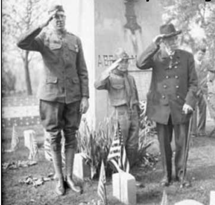
A post World War I Memorial Day celebration with a Dough Boy, a Boy Scout and a GAR member.