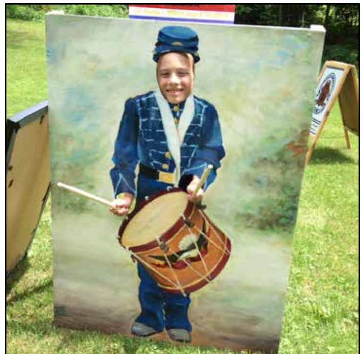
Civil War drummer boy pop-throughcut out, one of two donated to Grant Cottage by the Willard Camp.